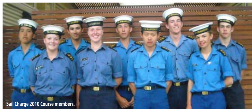
Sail Charge 2010 Course members.

Sail Charge 2010 kicked off in mid-January after the National Regatta, with 24 Sea Cadets, four Senior Ratings and one Master Cadet all gathering at Whangaparaoa. The week-long course is designed to qualify Sea Cadets to take charge of a crew under sail. The routine: wake up at 0600, have breakfast, go to cleaning stations then the first lesson on the water. Lunch, back on the water, then clean up the boats and back to base for dinner. We practised rigging the boats, sailing, capsize drills and the use of emergency flares.