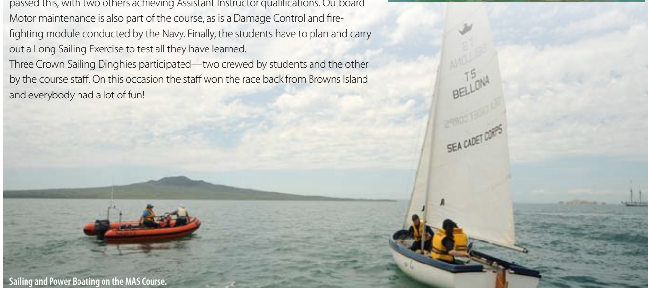
Sailing and Power Boating on the MAS Course.