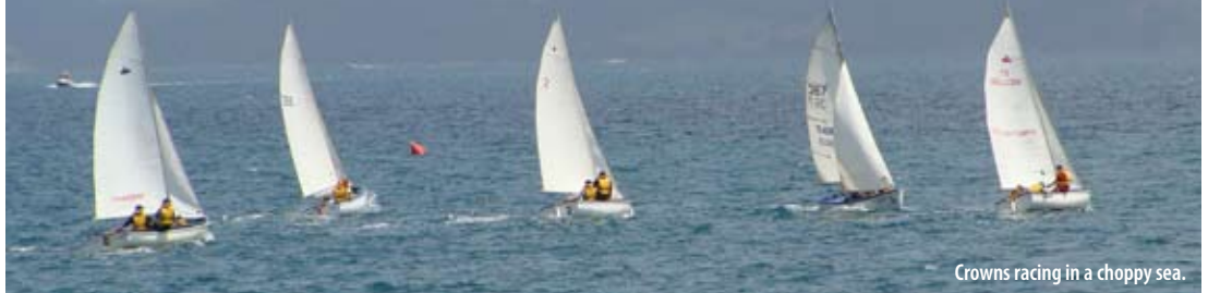
Crowns racing in a choppy sea.