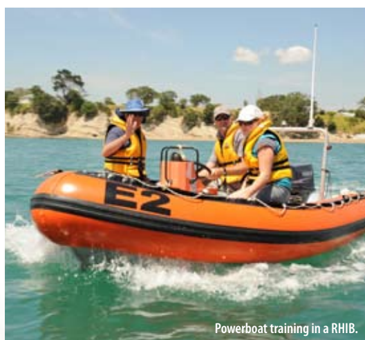
Powerboat training in a RHIB.

Three Crown Sailing Dinghies participated—two crewed by students and the other by the course staff. On this occasion the staff won the race back from Browns Island and everybody had a lot of fun!