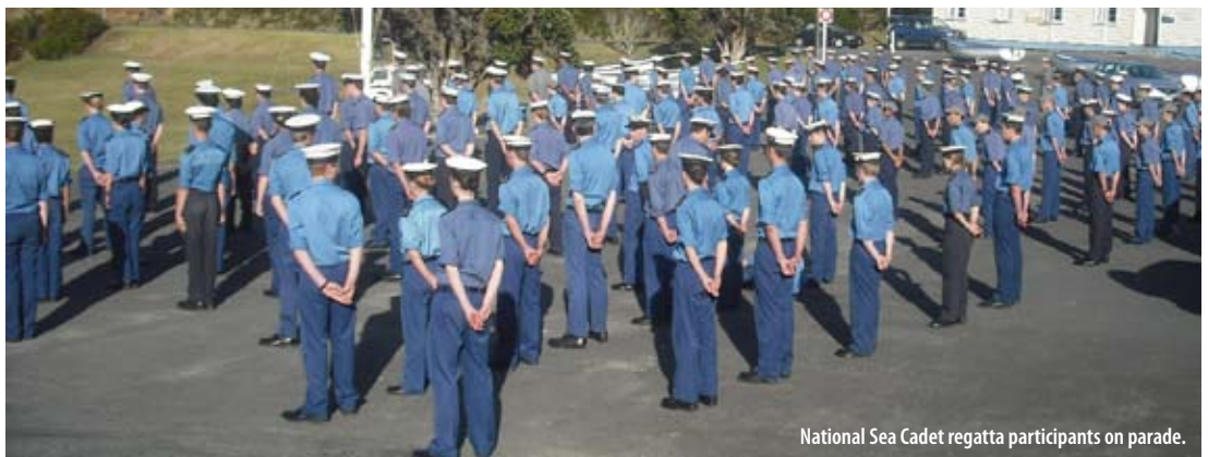
National Sea Cadet regatta participants on parade.

First: TS STEADFAST; Second: TS CORNWELL