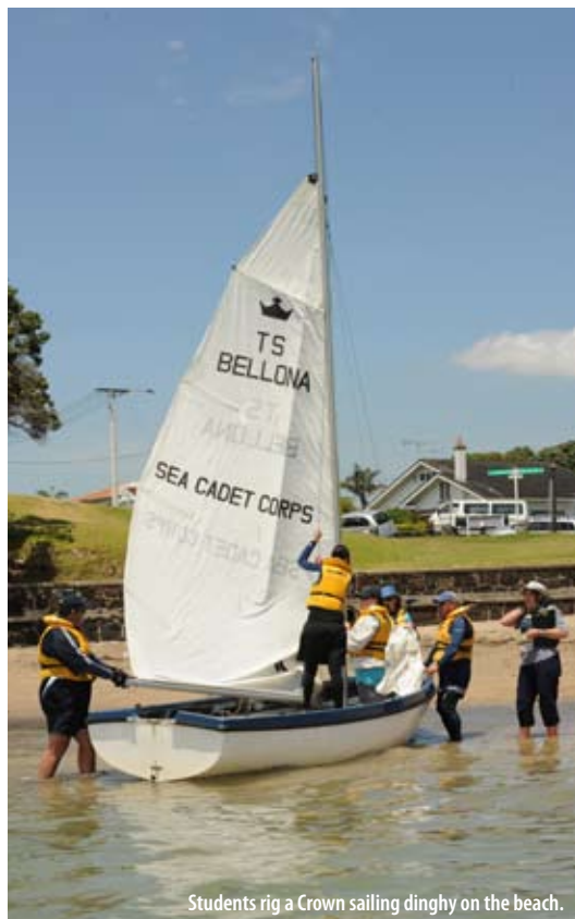
Students rig a Crown sailing dinghy on the beach.