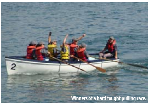
Winners of a hard fought pulling race.

All 17 Sea Cadet Units mustered for the National Sea Cadet Regatta held at Army Bay, Whangaparaoa in early January. The three Sea Cadet Regions—Northern, Central and Southern—all competed for their own trophies in Pulling, Sailing, Seamanship, Rigging, Ropework, Mast Construction and Shooting (0.22" 5.5mm) competitions.