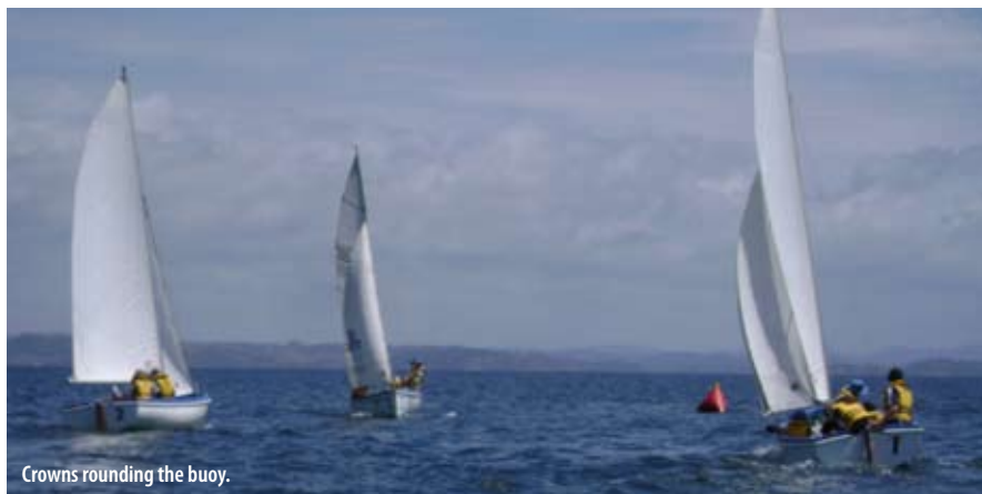
Crowns rounding the buoy.