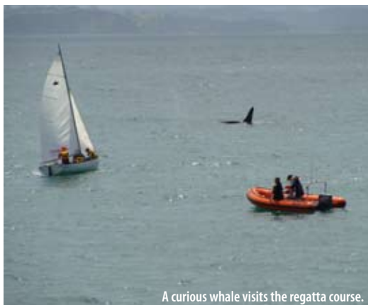
A curious whale visits the regatta course.